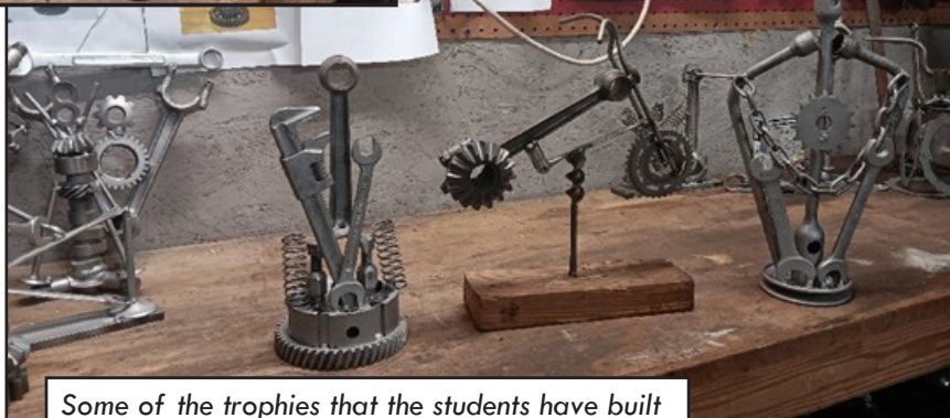
Some of the trophies that the students have built and are selling through the Speedster Program.