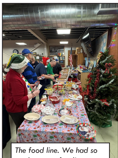
The food line. We had so much yummy food!