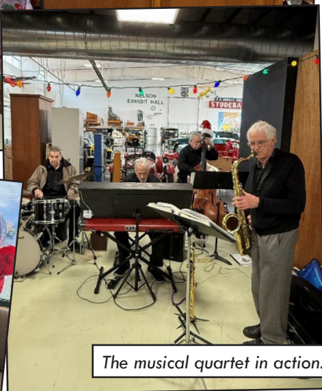
The musical quartet in action.